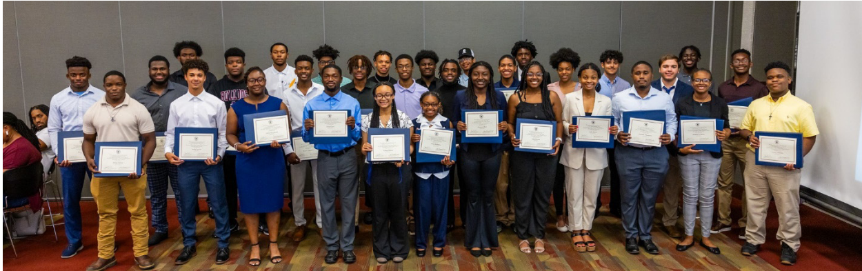
Mississippi State University Bagley College of Engineering 2023 Summer Bridge Participants

opportunities for high-achieving, underrepresented minority college students pursuing careers in engineering. When those barriers can be removed, engineering students are better able to adjust to a new learning and living environment and persist through their first year increasing the probability of timely graduation rates.