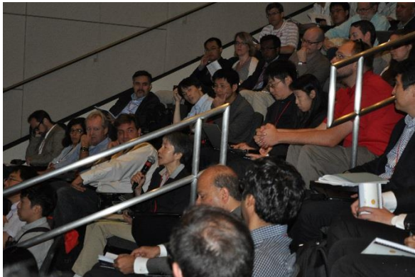
Plenary Keynote Session