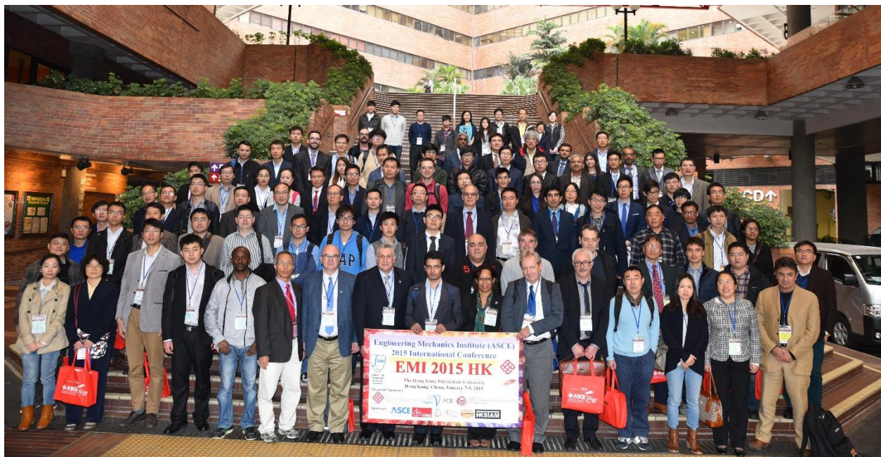
Group Photo at the 2015 EMI International Conference in Hong Kong