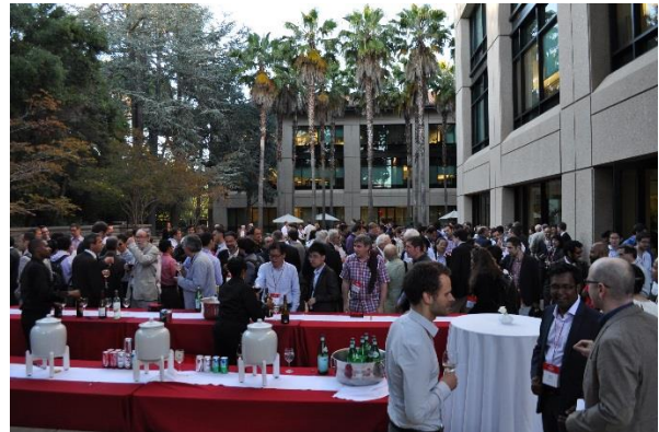
Reception at the Arillaga Alumni Center