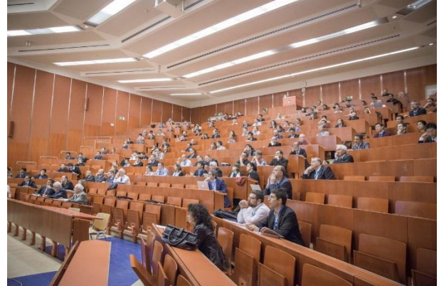
Plenary Keynote Session