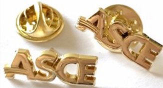
ASCE lapel pin