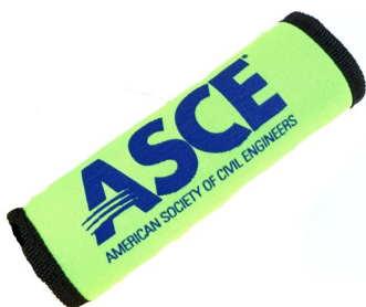
Luggage handle grips