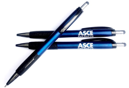
Ballpoint stylus pens