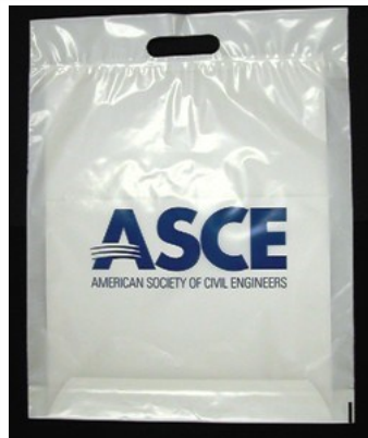
Eco plastic bags