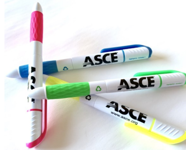
Dual Tip Highlighter / Twist Pen (assorted colors)