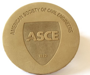
Recycled Leather Coaster