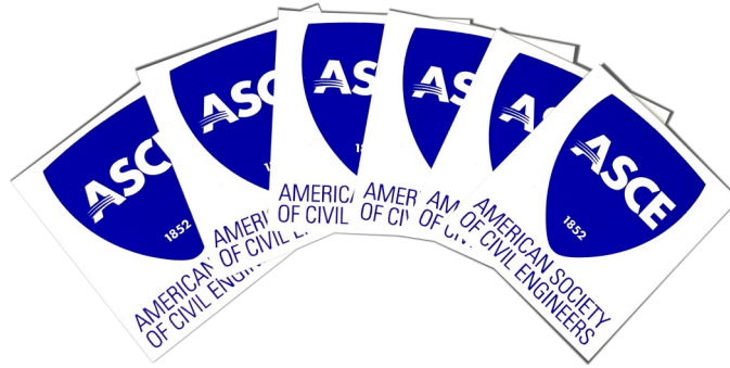
3.25" x 3.75" Vinyl ASCE