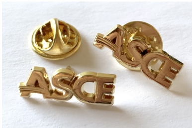
ASCE Lapel Pin