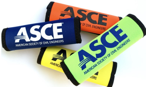
Luggage Handle Grips