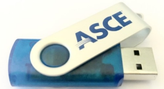
8GB Flash Drive