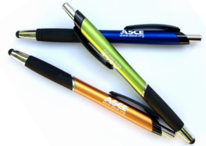
Ballpoint Stylus Pens