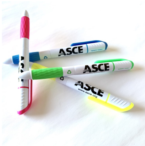
Dual Tip Highlighter / Twist Pen (assorted colors)