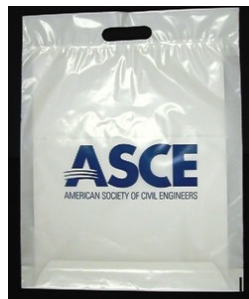
Eco Plastic Bags 15" x 19" x 3"