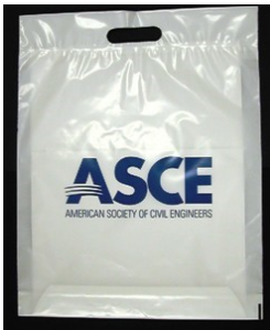
Eco Plastic Bags 15" x 19" x 3"