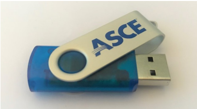
8GB Flash Drive