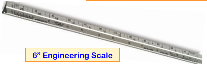
6" Engineering Scale