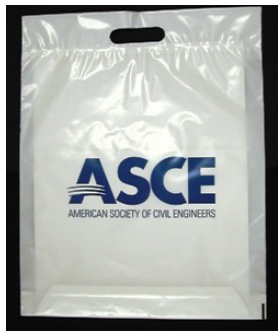
Eco Plastic Bags