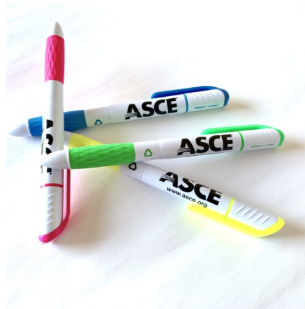
Dual Tip Highlighter / Twist Pen