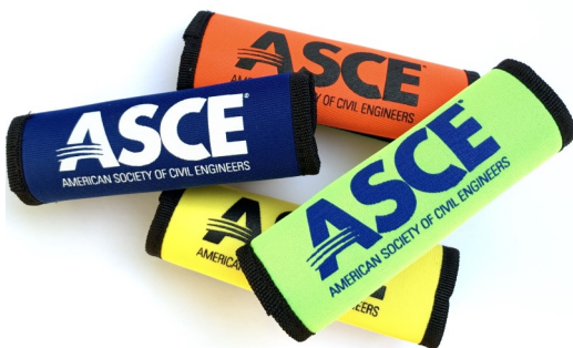
Luggage Handle Grips