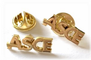
ASCE Lapel Pin