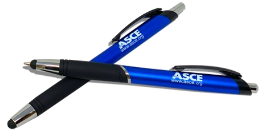
Ballpoint Stylus Pens