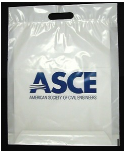
Eco Plastic Bags 15" x 19" x 3"