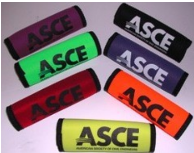
Luggage Handle Grips (assorted colors)