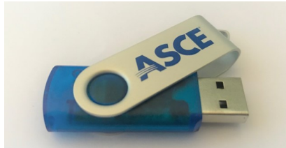
8GB Flash Drive