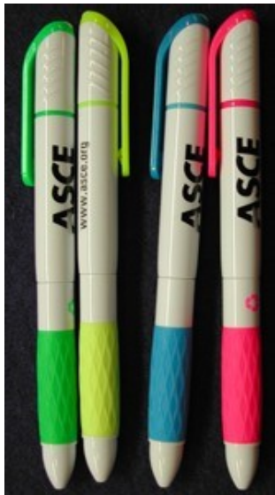
Dual Tip Highlighter / Twist Pen (assorted colors)