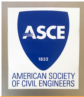
3.25"x3.75" Vinyl ASCE Sticker