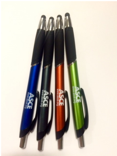
Ballpoint Stylus Pens (assorted colors)